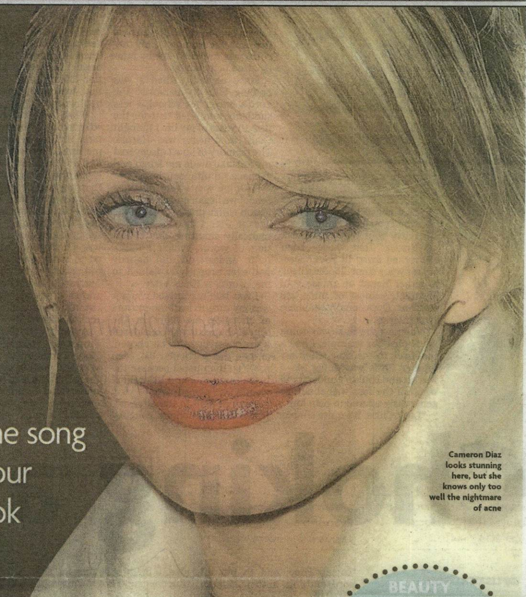
Cameron Diaz looks stunning here, but she knows only too well the nightmare of acne