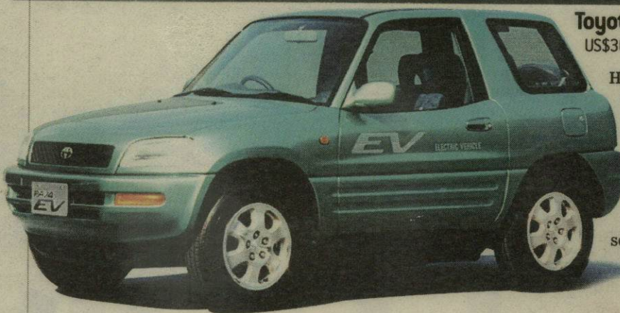
Toyota Rav4 EV (electric vehicle) ◀ US$30,000 (not available in UK yet)

TAMASIN CAVE , the editor of Ergo magazine, chooses practical, inspirational eco-friendly products