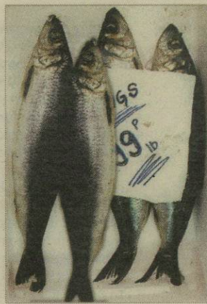
Thames herring ◀ £3.99 for two pre-packed

The 130-litre LG fridge-freezer GR-171 is the most energy-efficient – and only eco-labelled fridge-freezer – on the UK market. Fridges account for 6 per cent of the EU's energy consumption, and if everyone in the UK ran an A-rated, energy-efficient model, the country would be £1bn richer. From Currys (08701 545570, www.currys.co.uk )