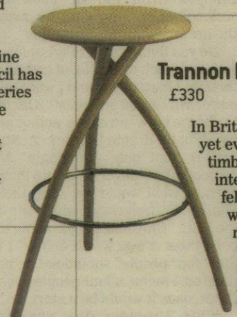
Trannon high stool ◀ £330

Consumers who want to choose between vulnerable over-fished stocks and fish from well-managed waters should buy from eco-labelled fisheries. The Marine Stewardship Council has accredited six fisheries so far, including the Thames herring. From independent fishmongers and Sainsbury's stores