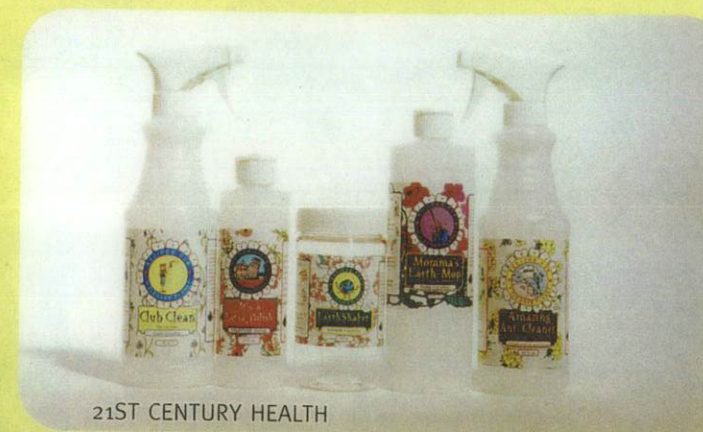
21ST CENTURY HEALTH

Century House), do. It has a ton of uses from washing up liquid and floor cleaner to shampoo and breath freshener, and is great for travelling. The bottle is crammed with quotes and ramblings on Dr Bronner's life philosophies and it is of course 100% natural and smells wonderful. ★